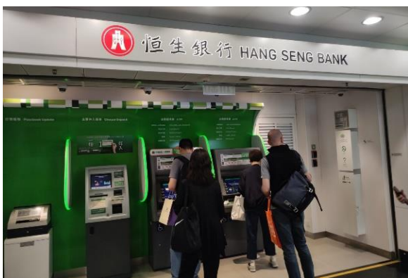
Hang Seng Bank - near Exit A, Wong Chuk Hang MTR Station