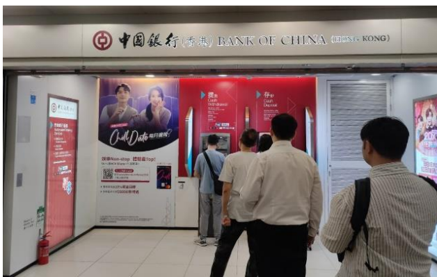
Bank of China - near Exit B, Wong Chuk Hang MTR Station